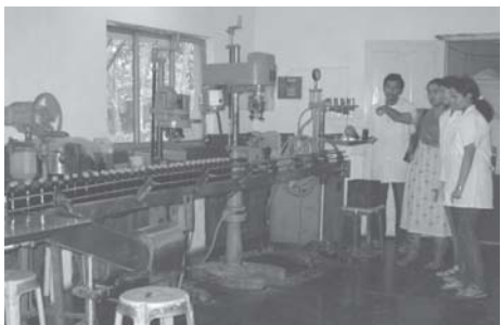
The Manufacturing Unit At Alva's Ayurvedic Pharmacy, Moodbidri

A one day visit to the SDM Ayurvedic Pharmacy (Manufacturing Unit of Ayurvedic formulations), Udupi, was organized by the Department of Pharmaceutics, for the third year B. Pharm students on April 5 th , 2010.