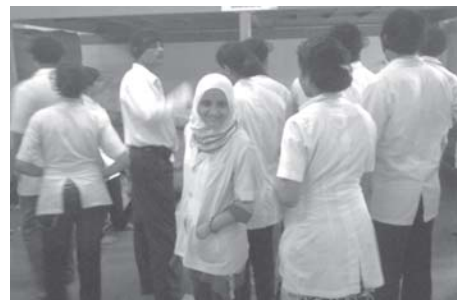
Visit to SDM Ayurvedic Pharmacy, Udupi

A similar visit was also arranged for the third year students to the Alva’s Ayurvedic Pharmacy (Manufacturing Unit of Ayurvedic