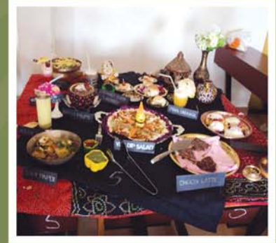
Cooking without Fire